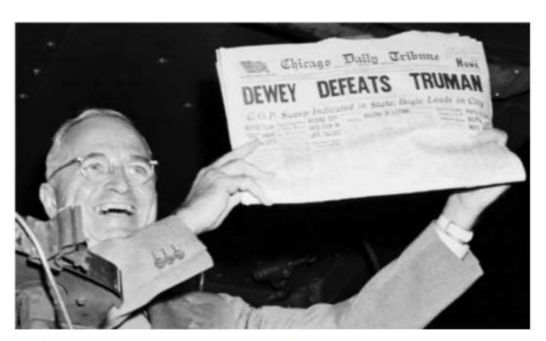
Ah, show us the shekels, Hiroshima Harry. Show us the shekels!